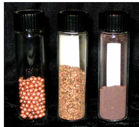
Copper produced as bright plating (left), bright flake (center) and dendrites (right) with Eltron's electrowinning technology.

The technologies described, and all related inventions are owned by Eltron Research & Development Inc, and protected by copyrights, trademarks, issued and pending patents, trade secrets, or other applicable intellectual property rights.