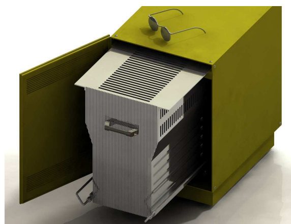
Figure 2. Numbered up microreactor unit for direct VHP.