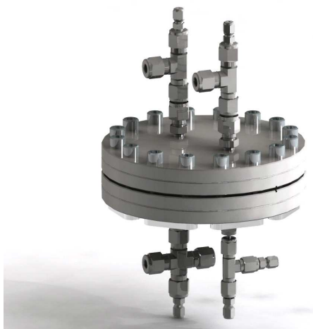
Figure 1. 3-D view of microreactor with all gas, coolant and thermocouple ports.

The single plate microreactor employed to this point has the appearance shown in Figure 1 . A numbered up microreactor unit has the appearance shown in Figure 2 .