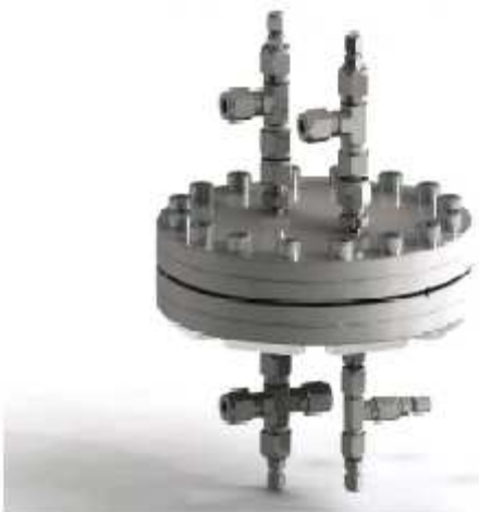
Figure 1. 3-D view of microreactor with all gas, coolant and thermocouple ports.

The single plate microreactor employed to this point has the appearance shown in Figure 1 . A numbered up microreactor unit has the appearance shown in Figure 2 .