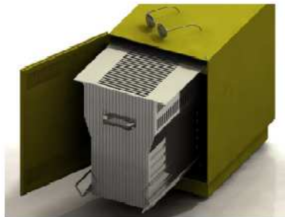
Figure 2. Numbered up microreactor unit for direct VHP.