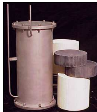
Bench-scale prototype of Eltron's catalytic filter for VOC destruction.