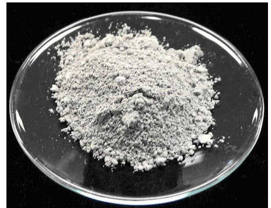
Optical image of LiFePO 4 powder prepared at Eltron R&D.