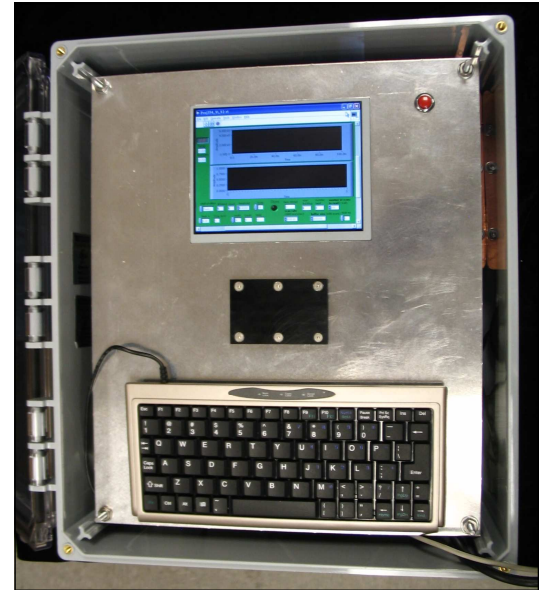
Front view Ammonia Sensor

Eltron has developed a prototype device (see photograph above) and has begun testing in conditions simulating the humid, dusty, ammonia-laden CAFO environment. Eltron is looking for a partner for field testing and commercialization. The technologies described, and all related inventions, are owned by Eltron Research & Development Inc and protected by copyrights, trademarks, issued and pending patents, trade secrets, or other applicable intellectual property rights.